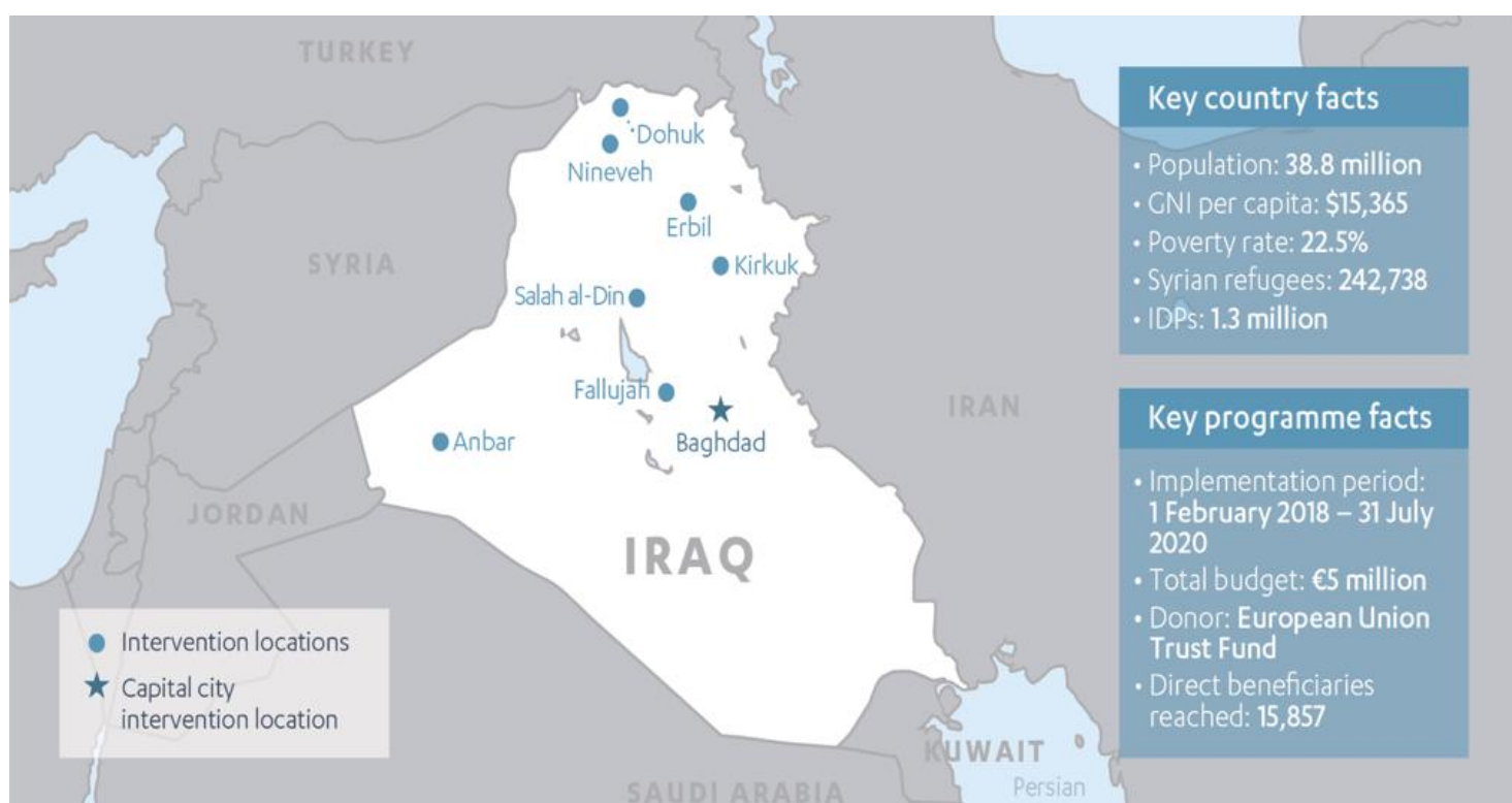
Figure 1: The UN Women Madad programme in Iraq: key facts and locations

This country summary report presents the findings and recommendations of the independent evaluation of UN Women's Strengthening the Resilience of Syrian Women and Girls and Host Communities (Madad) programme in Iraq. The country summary is an annex to the main synthesis report covering the regional programme in three countries. For an account of the evaluation approach, methods and questions, please refer to the main report and relevant annexes.