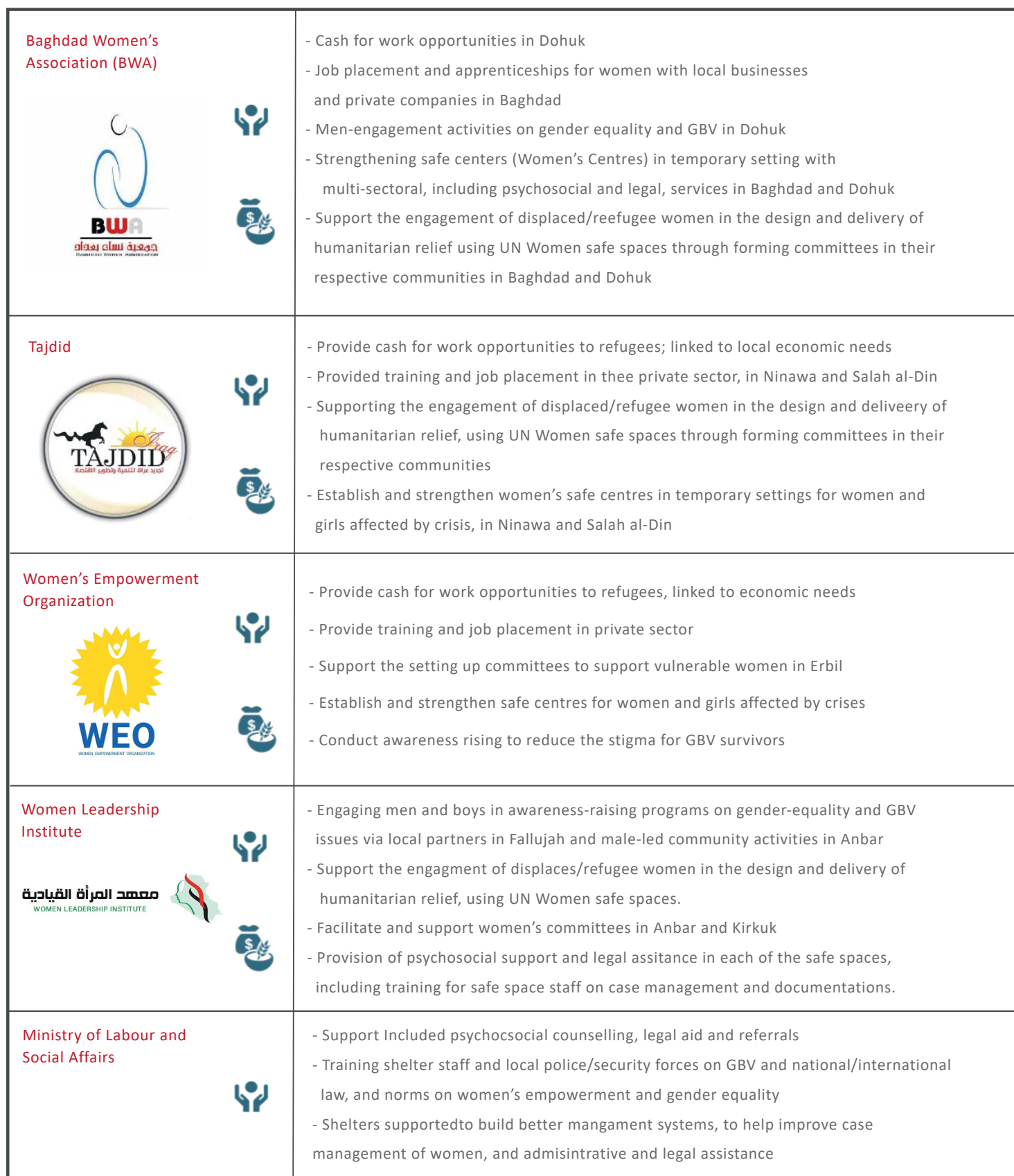
Table 1: UN Women core Madad partners and activities in Iraq