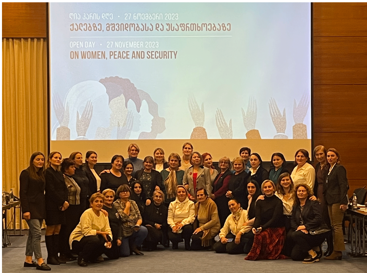
The Network of Women and Youth Peace Ambassadors members attending the annual Open Day on WPS to present IDP and conflict-affected women’s needs and priorities.

for developing collective agendas, IDP and conflict affected women have become more confident and effective in representing their communities.