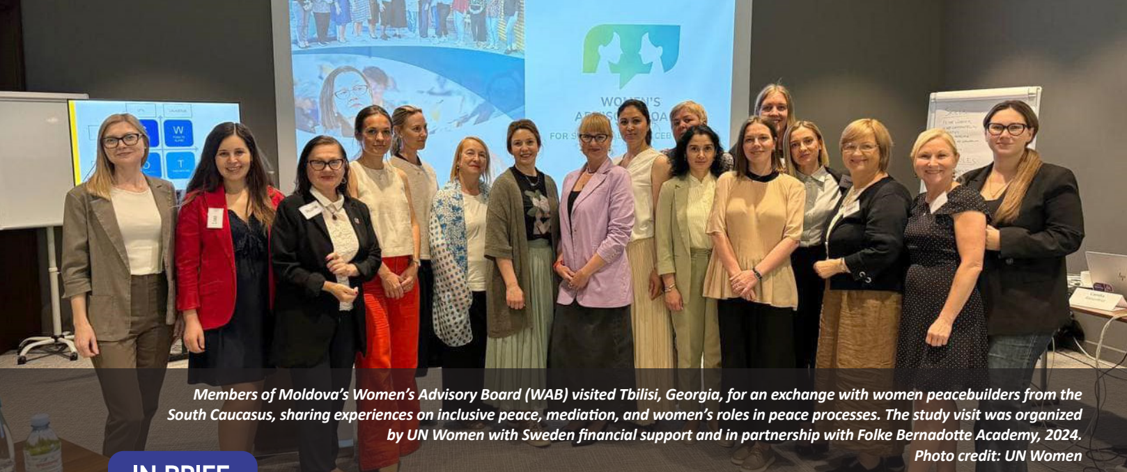
Members of Moldova's Women's Advisory Board (WAB) visited Tbilisi, Georgia, for an exchange with women peacebuilders from the South Caucasus, sharing experiences on inclusive peace, mediation, and women's roles in peace processes. The study visit was organized by UN Women with Sweden financial support and in partnership with Folke Bernadotte Academy, 2024.