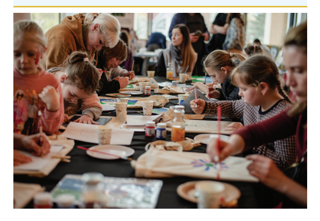
Children participating in a painting workshop

Mothers with children in primary education are not able to work at all, as they are not able to leave their children unattended and need to help them with homework. Mothers with children in secondary education are forced to leave them at home for online schooling without supervision, (Refugee Women Leader from Ungheni).<sup>98</sup>