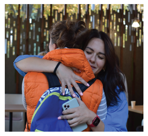
Women supporting women

While conflict and displacement may affect the mental health and psychosocial well-being of all affected populations, the specifics may vary according to gender, age and diversity. This in turn shapes individual risks and vulnerabilities, coping strategies, help-seeking behaviours, and access to support services.