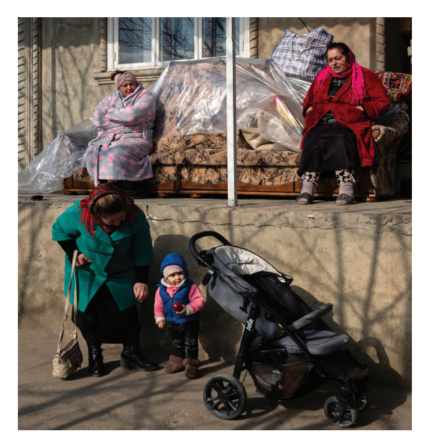
Roma family from Ukraine outside of their shelter house in Drochia

It is much harder for women coming from urban areas to be accommodated in villages where sometimes they lack proper infrastructure: outside toilets, bathrooms, water supplies or sewage. Women with infants find it particularly difficult because they have to adjust to their children' needs, (CSO Representative, female, Chisinau).