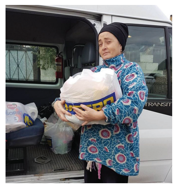
Refugee receiving food products from NGO Motivatie

Lack of food for infants or formula-fed children is a challenge. In the beginning there was food for children, but now these are no longer offered, (Representative of RAC, female, Chisinau).