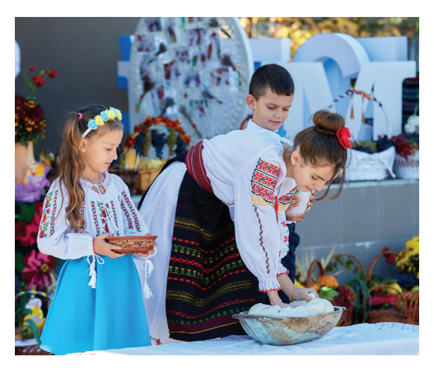
Refugees and locals of Cruzești commune participating in a festival for peace

UNHCR's Participatory Assessment reports that Roma refugee respondents were welcomed by the network of Roma community mediators in Moldova which helped them feel safe and accepted.<sup>116</sup> The Romani language spoken by Roma communities in Ukraine and Moldova is similar which facilitates communication.<sup>117</sup> While strong social solidarity for Ukrainian Roma within the Moldovan Roma community has provided a source of strength and protection, they continue to be marginalised amongst the broader Moldovan society.